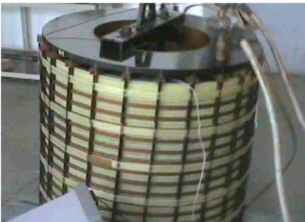
Arc suppression coil prior to drying by DC